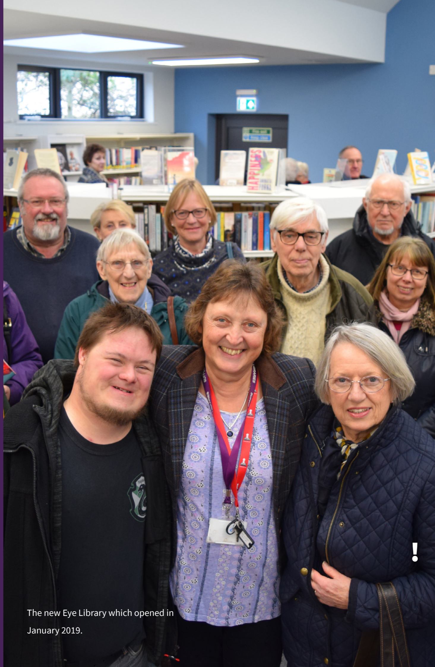
The new Eye Library which opened in January 2019.

Improving the look and feel of physical spaces is clearly a challenge with limited funding, but we will work with Suffolk County Council and community groups to harness all available planner development funding to improve buildings.