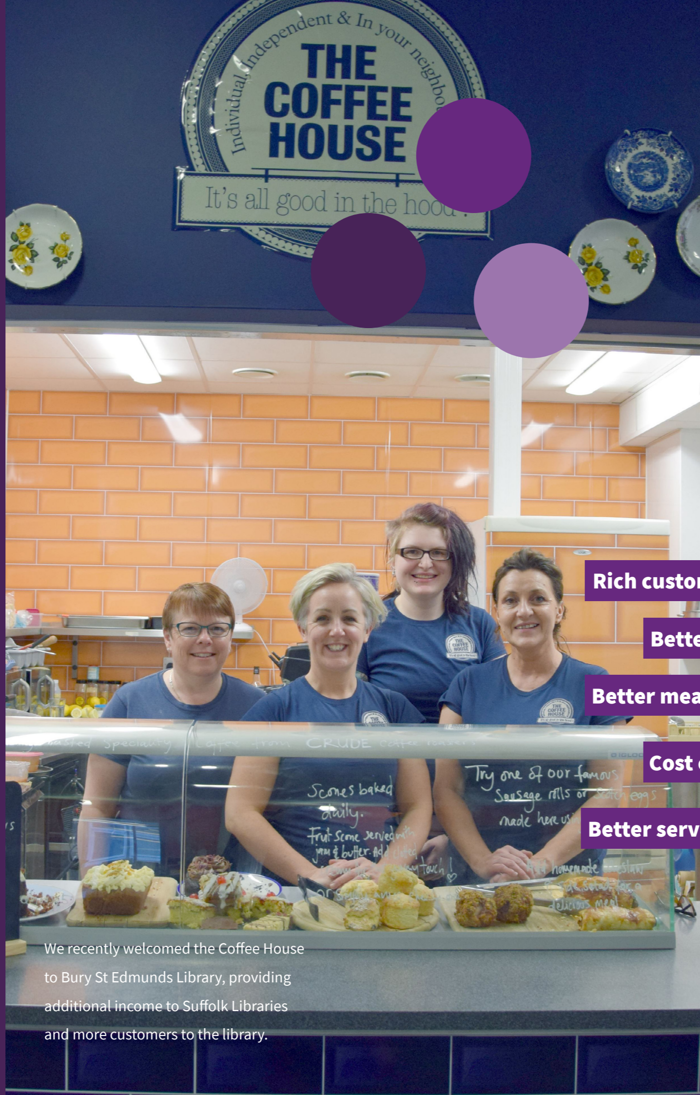
We recently welcomed the Coffee House to Bury St Edmunds Library, providing additional income to Suffolk Libraries and more customers to the library.

Raising awareness of what libraries offer, and then prompting people to take up the offer is a fundamental challenge with such a diverse and dispersed customer base.