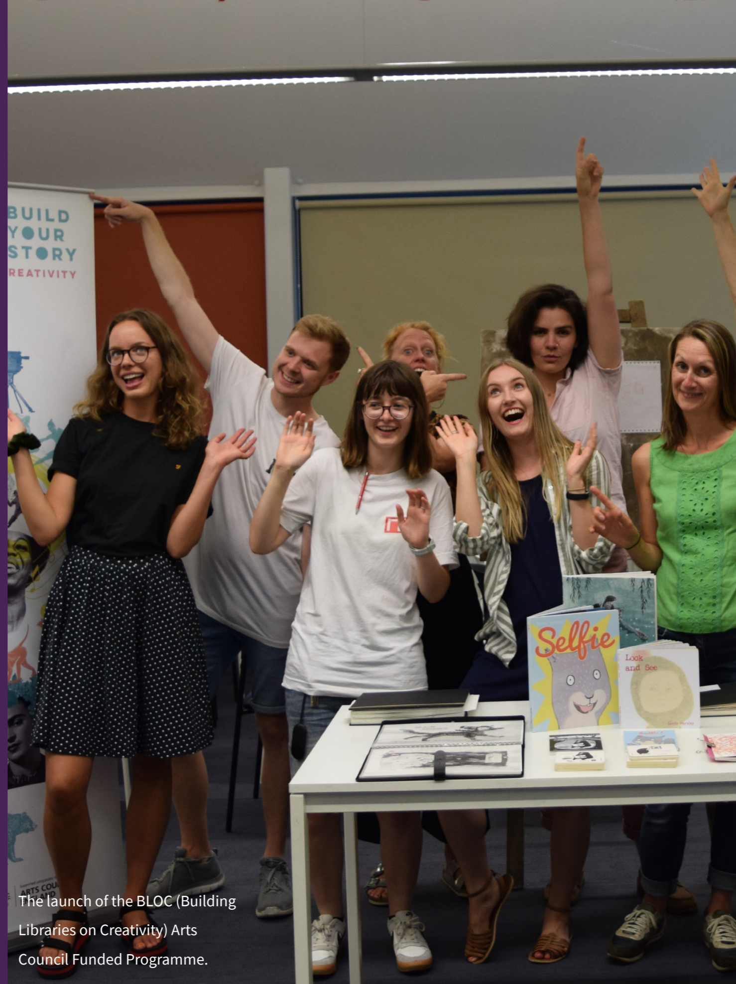
The launch of the BLOC (Building Libraries on Creativity) Arts Council Funded Programme.

"Creativity is contagious. Pass it on." -Albert Einstein