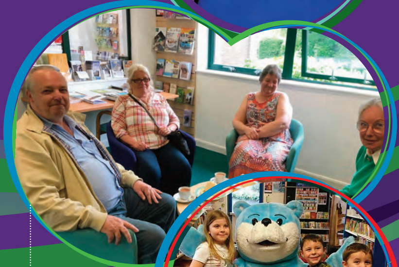
The Friday afternoon tea club at Wickham Market Library.