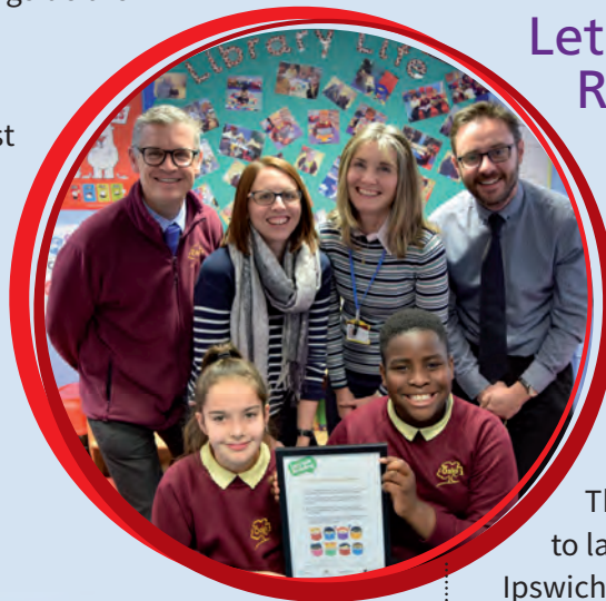
Staff and pupils at The Oaks Primary School with their reading pledge.

Lowestoft Literary Festival returned in October 2017. This event is organised by the Friends of Lowestoft Library and the programme included biologist and primatologist Ben Garrod and presenter, author and journalist Libby Purves.