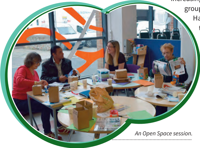
An Open Space session.

Suffolk Libraries is also carrying out a detailed evaluation of the Open Space model to provide evidence of the way the project and the library environment is supporting people's wellbeing.