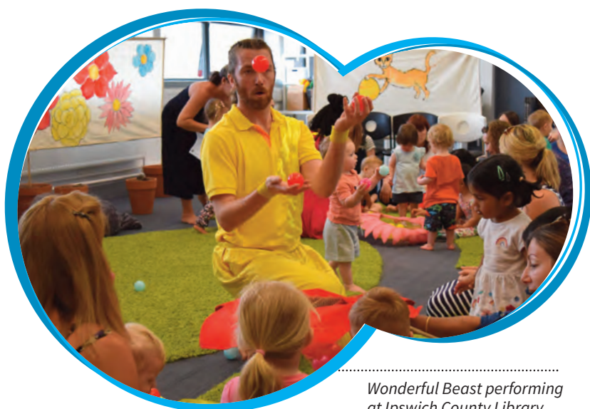
Wonderful Beast performing at Ipswich County Library.