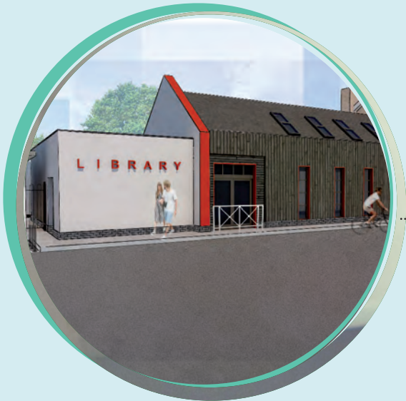
The design for the new Eye Library.

■ The opening hours also changed at Eye Library following consultation with customers and the county council announced that Eye Library would be moving to a new building in 2019.