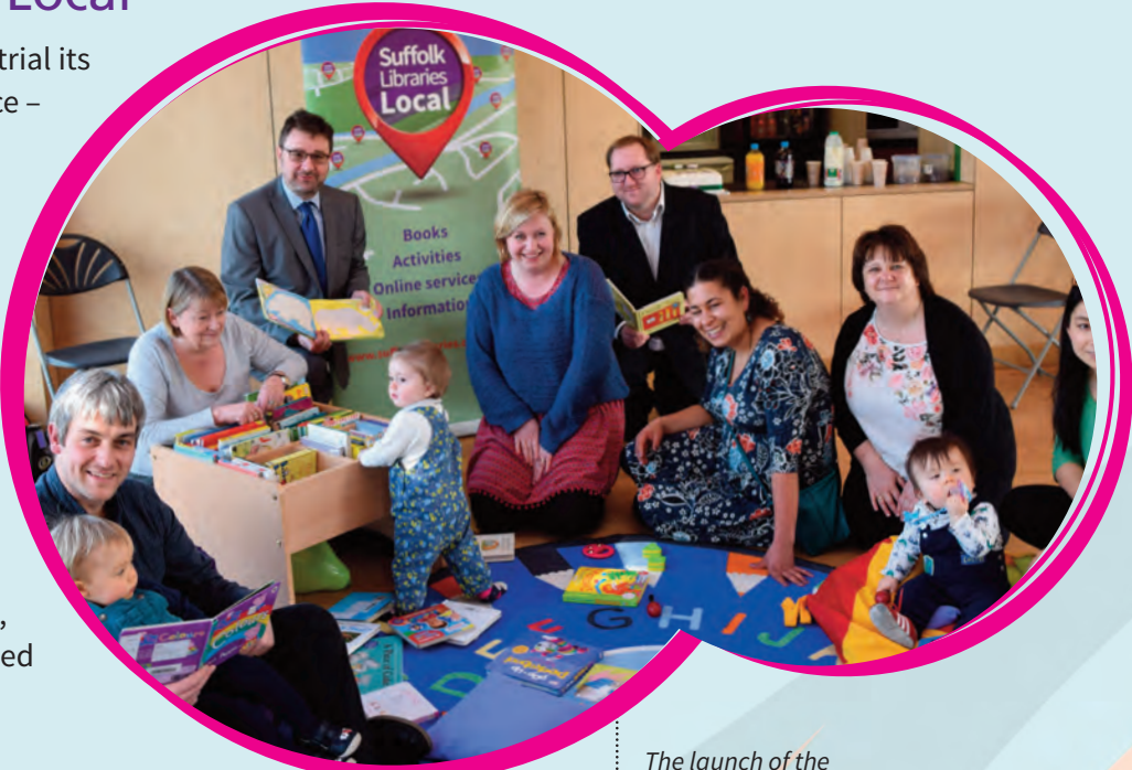
The launch of the Rushmere Suffolk Libraries Local session.

Suffolk Libraries continued to trial its new 'Pop-up' library experience – Suffolk Libraries Local – which aims to deliver a weekly slice of library life to local communities. Three pilot sites were trialled during the year and the most successful – in Shotley Village Hall – has continued into 2018-19. Thanks to locality funding from the county council and support from Ipswich Borough Council, a new session was also launched at Ransomes Pavilion on the outskirts of Ipswich.