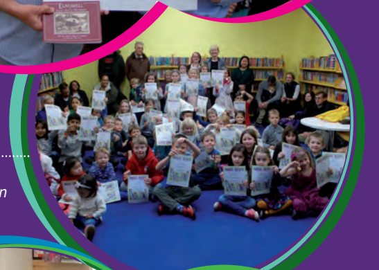
Summer Reading Challenge Presentation at Newmarket Library.