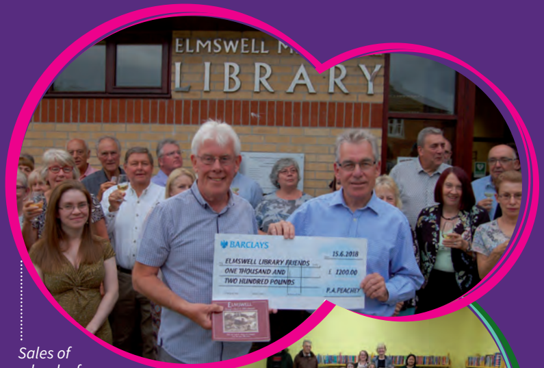
Sales of a book of rare postcards raised £1,200 for Elmswell Library.