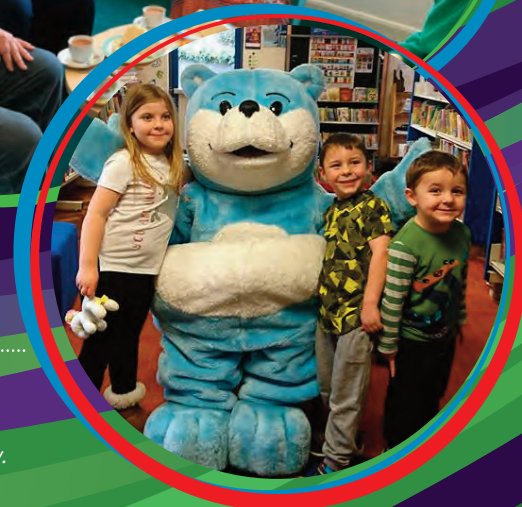
Bookstart bear meeting children at Chantry Library.