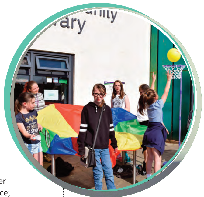
The Launch of the Move It equipment at Gainsborough Library.

New Chapters has also worked to improve the availability of resources, such as Books on Prescription and is building other unique reading lists suggested by people with lived experience; such as those affected by addiction or bereavement by suicide.