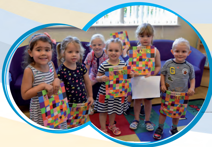
Children were given a special book to keep after the Storywalk event at Stoke Library.