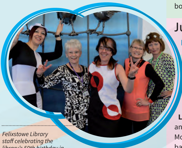
Felixstowe Library staff celebrating the library's 50th birthday in 1960's outfits.