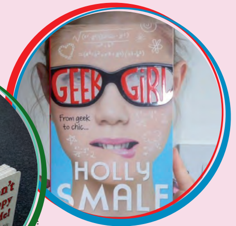
Two of the winners of the Get Caught Reading photo competition.