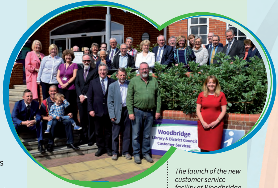
The launch of the new customer service facility at Woodbridge Library.

Felixstowe Library celebrated its 50th birthday with a series of 1960's themed events.