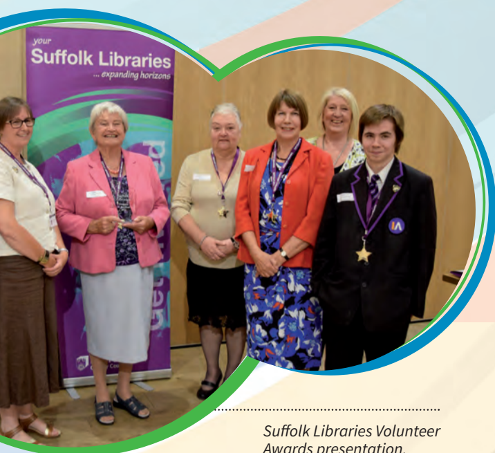
Suffolk Libraries Volunteer Awards presentation.

■ The Newmarket Lion's Club kindly donated £1,000 to enable the library to purchase 'storywall' furniture for the children's library. The library also received nearly £10,000 of funding from the Racing Foundation to preserve and display the library's unique racing collection.