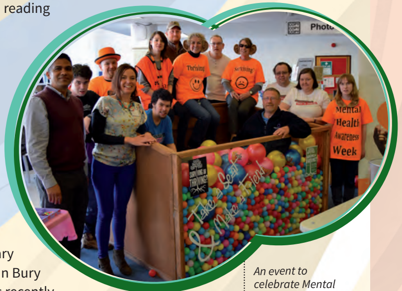
An event to celebrate Mental Health Awareness Week at Ipswich County Library.