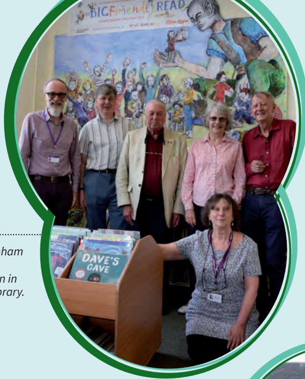
The Debenham Library Foundation in the new library.

■ Debenham Library moved to a larger and improved library space at Sir Robert Hitcham Primary School. The move was the culmination of a partnership project involving Suffolk Libraries, the Debenham Library Foundation, Sir Robert Hitcham Primary School, Suffolk County Council, Sir Robert Hitcham Foundation Trust, Mid Suffolk District Council and Debenham Parish Council and has had the support of Aspoll Cyder and many local people who helped to raise funds.