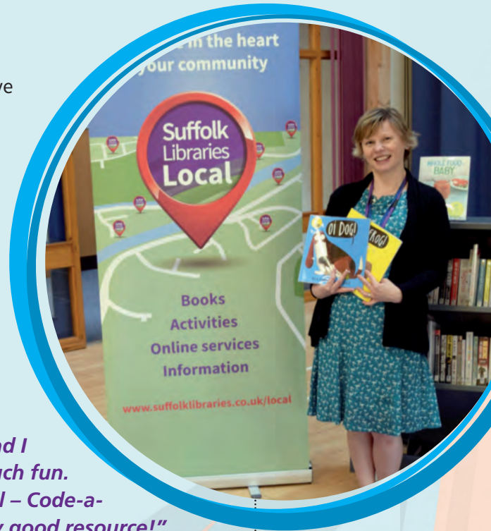
The launch of the first Suffolk Libraries Local session in Red Lodge.

Suffolk Libraries also worked with software developers Dootrix to develop new bespoke self-service equipment which was being introduced across libraries during the summer of 2017.