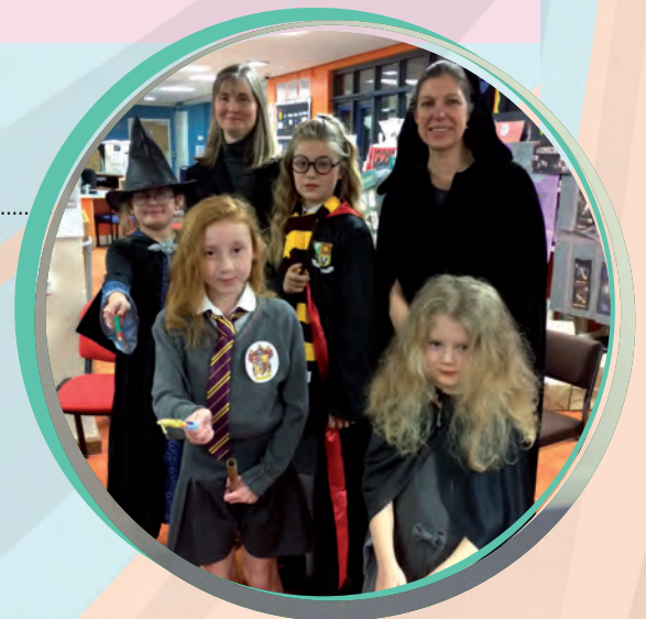
Harry Potter Fancy Dress competition at Chantry Library.

■ Several libraries organised events to celebrate the return of Harry Potter Book Night .