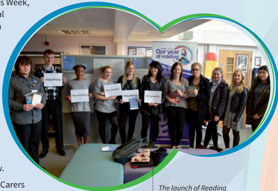
The launch of Reading Well for Young People at Great Cornard Library.

Following the success of the Ipswich County Library Open Space sessions, a similar activity launched in Bury St Edmunds Library in September 2016 which has recently been followed by the start of a new session at Haverhill Library. The sessions are run in partnership with Norfolk & Suffolk NHS Foundation Trust and Julian Support. They provide an informal opportunity for people to talk about a mental health issue or anything they would like to discuss.