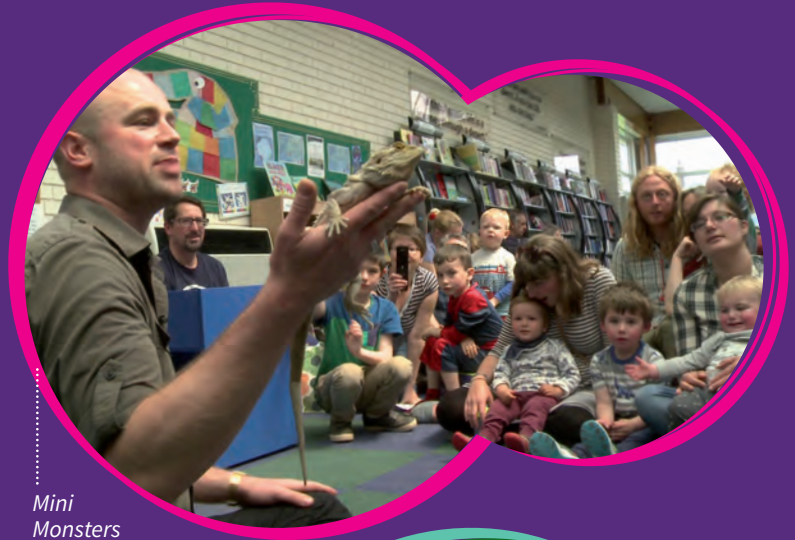
Mini Monsters Creepy Crawly Roadshow.

“The libraries in Suffolk provide an invaluable service to the community. They are important for social interaction and the use of facilities for people who for economic reasons would not be able to access all the facilities for learning, leisure, social etc.”