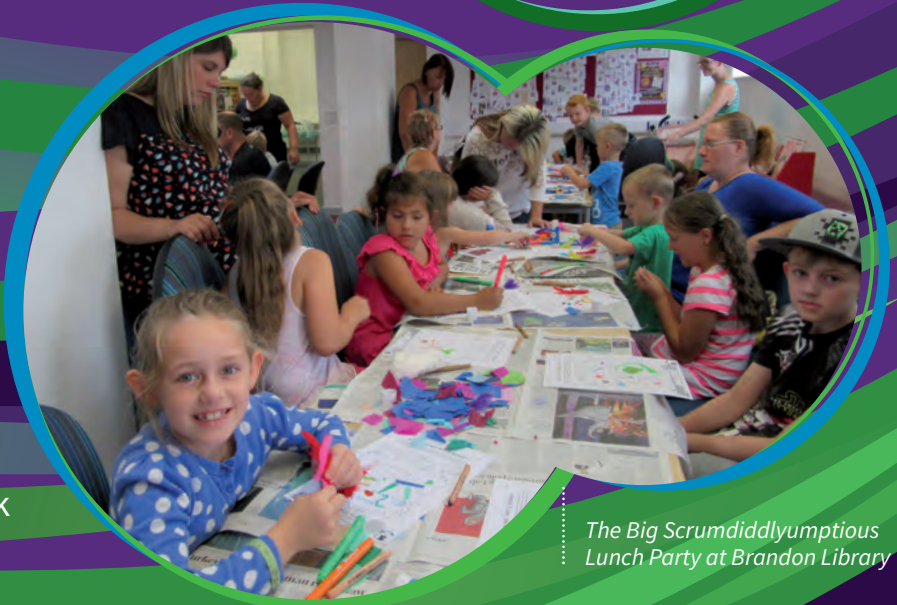
The Big Scrumdiddlyumptious Lunch Party at Brandon Library