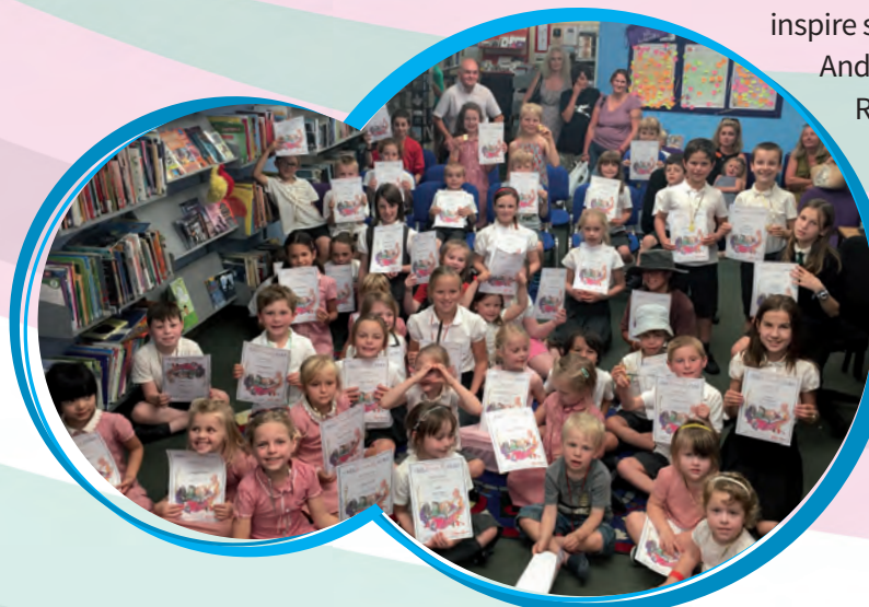
The Summer Reading Challenge presentation at Framlingham Library.

As part of the new Suffolk Writes project, offering people the chance to publish their own work through the library eBook platform, Suffolk Libraries converted the winning entries of the Student New Angle Prize (SNAP) for University Campus Suffolk students (UCS) into library eBooks.