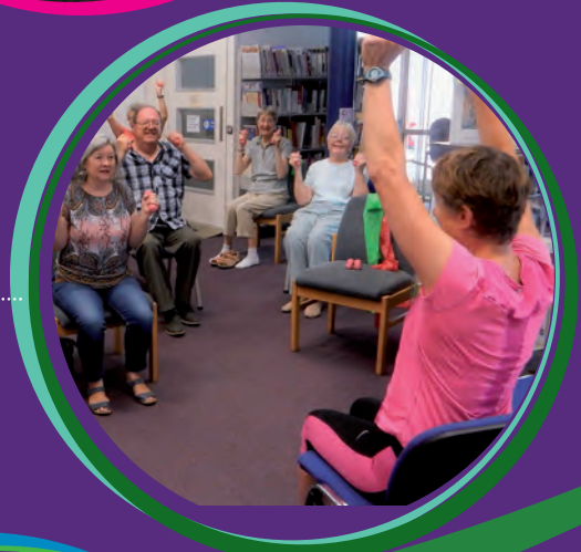
Exercise sessions at Halesworth Library