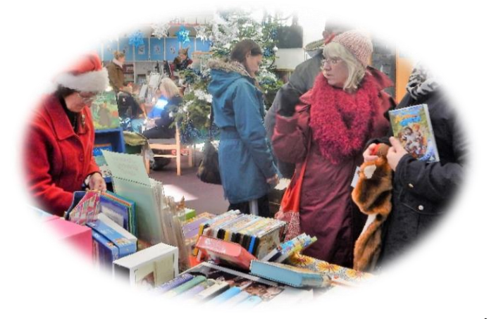
JANUARY – ADVERTISING THE FEBRUARY 4<sup>th</sup> MURDER MYSTERY IN OUR WINDOW