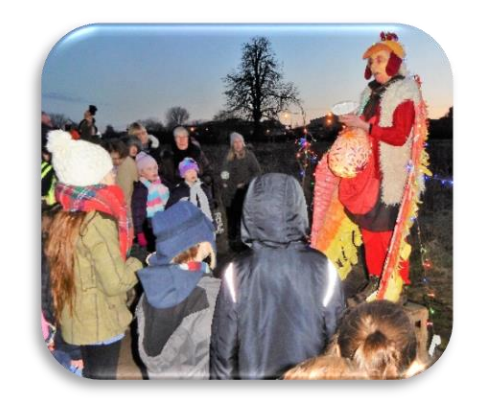
FEBRUARY – WINTERLIGHT FESTIVAL IN COLLABORATION WITH THE MILLENNUM GREEN TRUST & THE MOLLY DANCERS