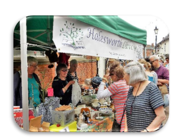
SEPTEMBER – QUIZ NIGHT (WE HAVE TWO A YEAR)