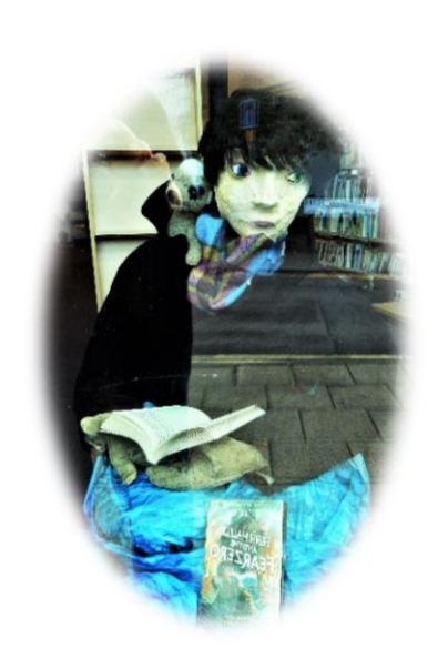
DECEMBER – CHRISTMAS FAIR