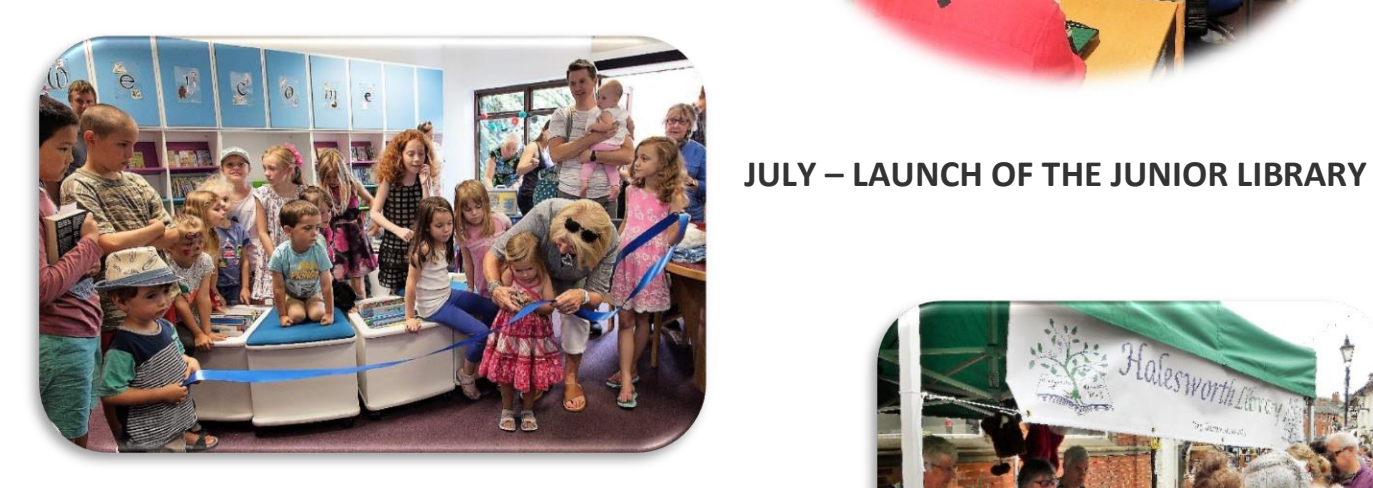
AUGUST – ANTIQUES STREET MARKET STALL